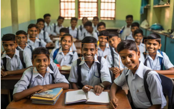
Fig. 2. Camera collected classroom_image_1

The fig.2. shows sample copy of class room camera collected image for making attendance, this camera image collection process will continue front to back very aften to get whole class attendance in while. The number of students data will update in google sheet with their ID, login date and time as usual. Duplicate or multiple entry will be eliminated as database algorithm. The frame size number of faces identification depends on camera ant its resolution.